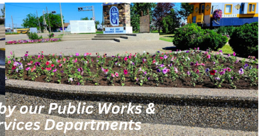
Great work done by our Public Works & Community Services Departments