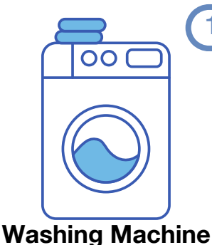
65 Liters/load or 14.36 imp. gal./load