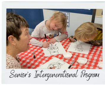
Senior's Intergenerational Program