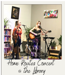
Home Routes Concert @ the Library