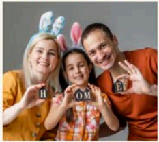
Visit the Easter Bunny