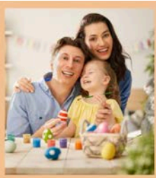
Games & Crafts